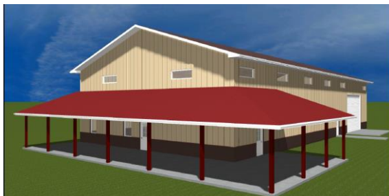
Planned Exhibit Building with Veranda